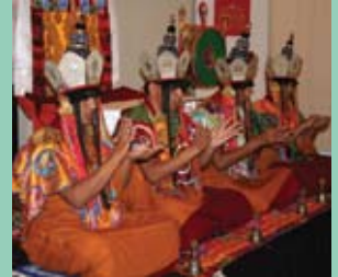
Tibetan Monks chanting

Cultural Patrons are a group of Asia House Friends who have a special interest in Asian culture and would like to play a more direct role in supporting the work we undertake. As a Cultural Patron you will be more closely involved with our unique, leading Pan-Asian organisation, have an opportunity to participate in shaping our future and will join a group of like-minded friends who share a passion for Asian culture. Whatever your background or specialism, you will find something of interest to you. As a Cultural Patron, you and a nominated guest will join us for private previews of major Asian cultural exhibitions and at exclusive events specially organised for our patrons.