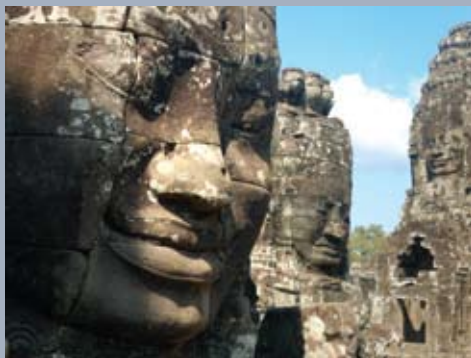
The Bayon, Angkor

From Vientiane the group will fly to Siem Reap to explore the awe-inspiring Hindu temple complex of Angkor. With over a dozen major temples and innumerable ruins, some still covered in jungle, there will be ample time to examine Angkor Wat, the biggest religious monument in the world, built in the 12th century. A recreation on earth of the Hindu cosmos, this mystical temple is covered with intricately carved bas-reliefs depicting scenes from the great Hindu epics and adorned with carvings of apsaras , alluring female celestial dancers. The visit includes outlying temples, including Banteay Srei, a jewel of a temple, dating from the 10th century, built in pink sandstone and decorated with the most dazzling carvings of all.