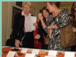
Culinary event at Asia House

For more details please contact our Friends helpline on 020 7307 5454 or e-mail friends@asiahouse.co.uk