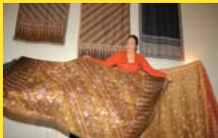
Obin exhibits textiles during Indonesia Inspired at Asia House, October 2008.

2008 also saw the expansion of our regular Festivals of Asian Literature and Asian Film, bringing the best of contemporary writing and film-making on and about Asia to a UK audience. These were sell-out events, with demand far outstripping ticket availability. We are pleased to be able to give you preview details of the Spring 2009 Festival of Asian Literature on page 9.