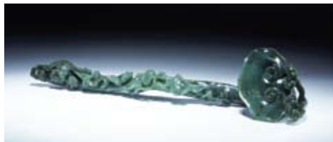
Jade ruyi given to the first British Embassy by Emperor Qianlong, circa 1790.

Wednesday 21 January at Asia House Doors 12.15pm, light lunch 12.30pm, followed by lecture 1.15-2.15pm.