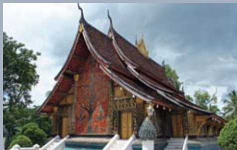
Wat Xieng Thong, Luang Prabang

With its gentle pace and large population of resident monks, Luang Prabang is a treasure trove of 33 glittering Buddhist temples dating from the 16th century, exquisitely gilded and frescoed, with multi-tiered roofs sweeping to the ground. The Party will visit the Royal Palace, view French Colonial buildings and take a boat ride along the Mekong river to the sacred Pak Ou caves to see the thousands of Buddha images left by pilgrims. Continuing to Vientiane, the current capital, the tour will visit further museums and view the silkweaving workshops which have contributed to the revival of the ancient textile traditions of Laos.