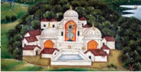
Haveli Pichhvai, 18c (detail)