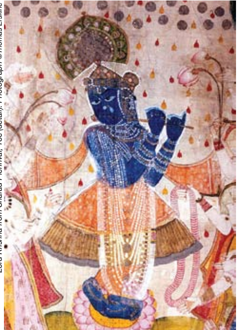
Lord Krishna from Sharad Pichhvai, 18c (detail)

Asia House Friends ONLY Free - booking recommended