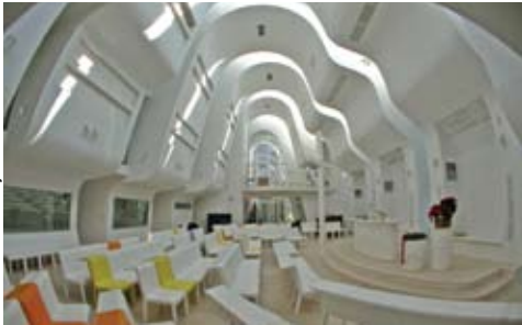
Harajuku Protestant Church