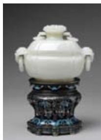
Jade lidded bowl with London-made enamelled silver stand, bowl Qianlong period (1736-1795), stand circa 1850.

This lunchtime lecture is presented in association with the China Society. Ticket price includes a light sandwich lunch.