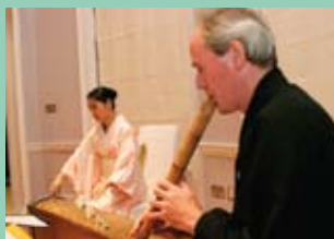
Cultural preview party at Asia House

Your support as a Cultural Patron provides a vital source of funding for our programmes. We produce more than 125 events annually, all in support of our goal of increasing understanding of Asian cultures and business. Your donation ensures that we have the resources to keep Asia House at the forefront of Asian culture in Britain. You can become a Cultural Patron starting at a donation of £550 per year.