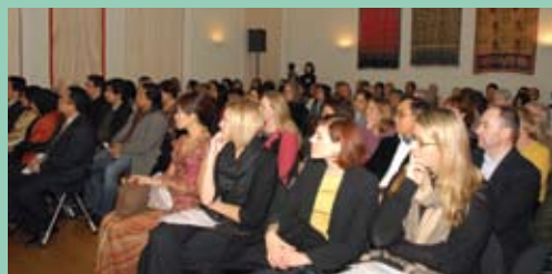
Indonesia Inspired audience, October 2008

For more details please contact our Friends helpline on 020 7307 5454 or e-mail friends@asiahouse.co.uk